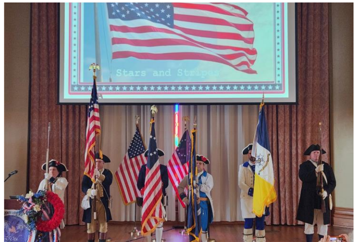
GPT-SAR Color Guard Presentation of Colors at Flag Day Ceremony