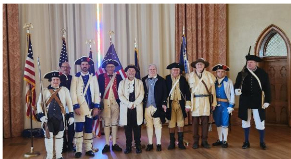
Compatriots and Color Guard pose after the ceremony.