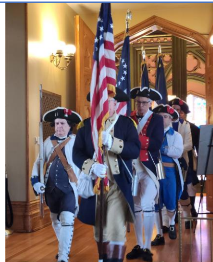
GPT Color Guard entering the Legislative Hall