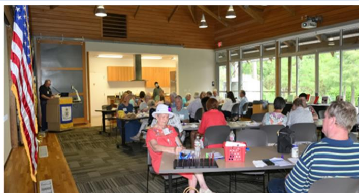
Scene from the 2024 Summer Social at Hilltop Arboretum